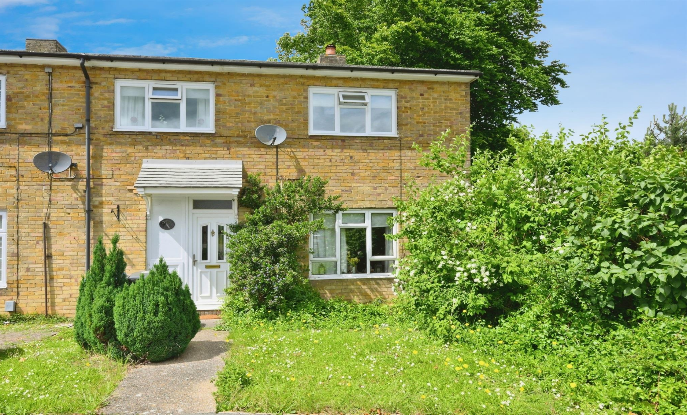
Little Brays, Harlow CM18 6ER