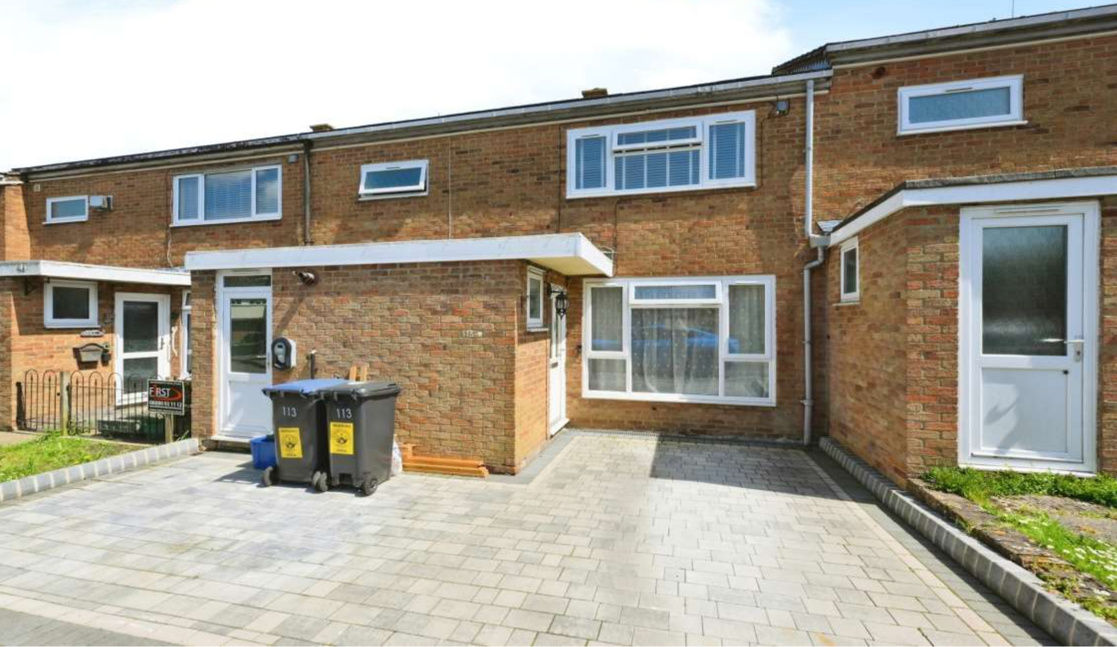
Purford Green, Harlow CM18 6HP