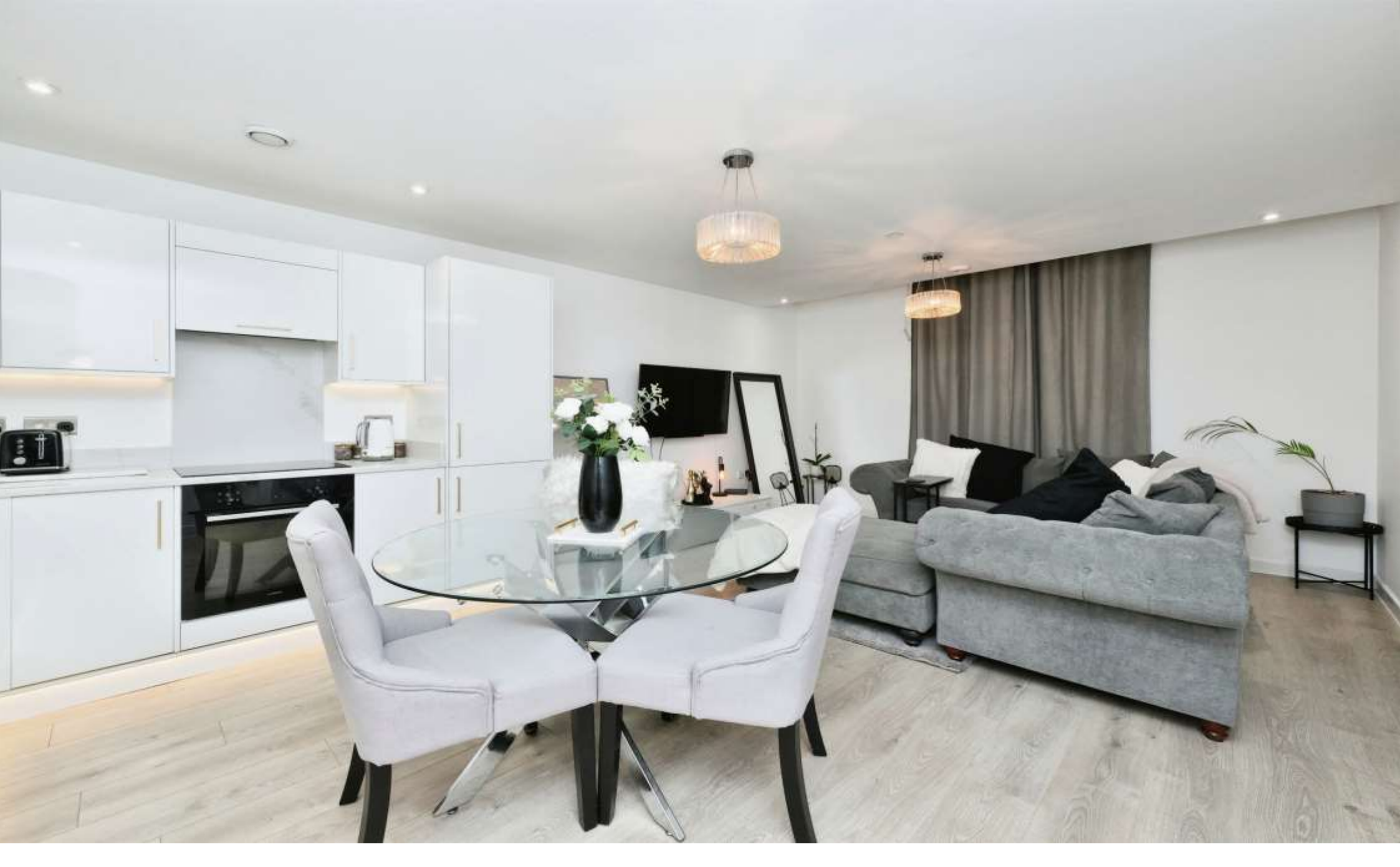
Edinburgh House Edinburgh Gate, Harlow CM20 2JE