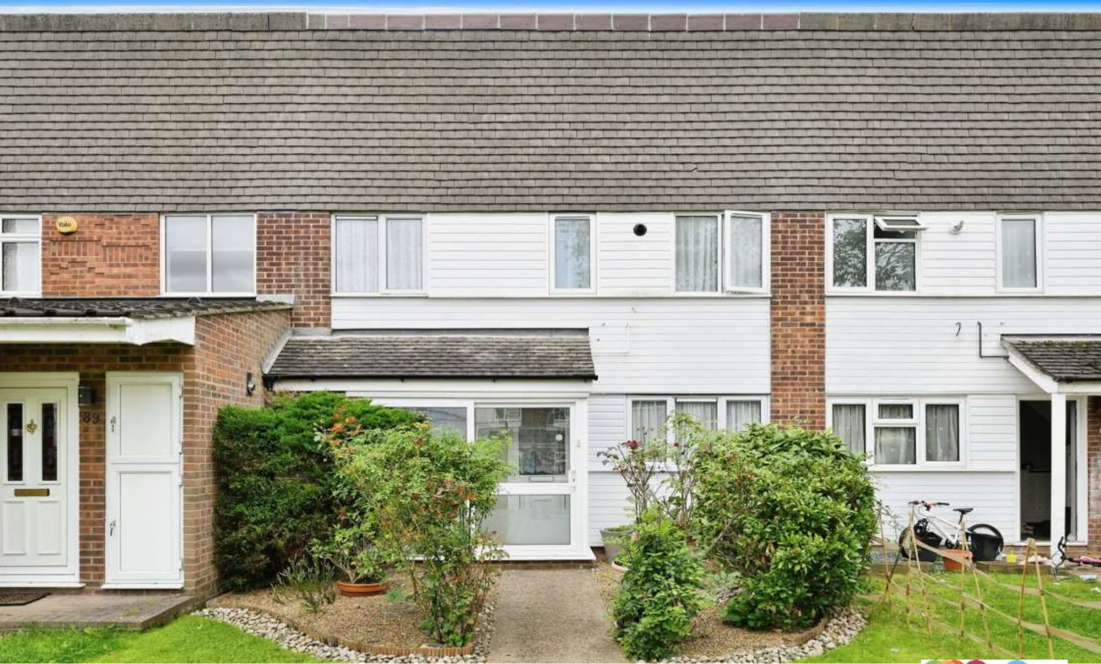
Little Cattins, HARLOW CM19 5RN