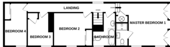
1ST FLOOR 737 sq.ft. (68.5 sq.m.) approx.