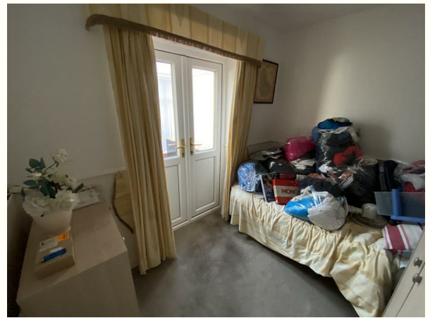
Bedroom no.2 rear:

Single panelled central heating radiator. Dado rail. Upvc French doors lead to: