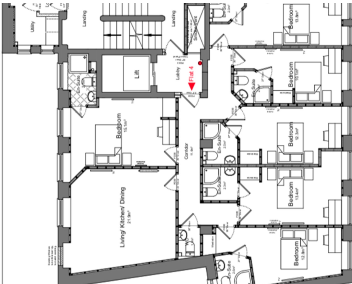
Proposed Second Floor Plan (172m²)