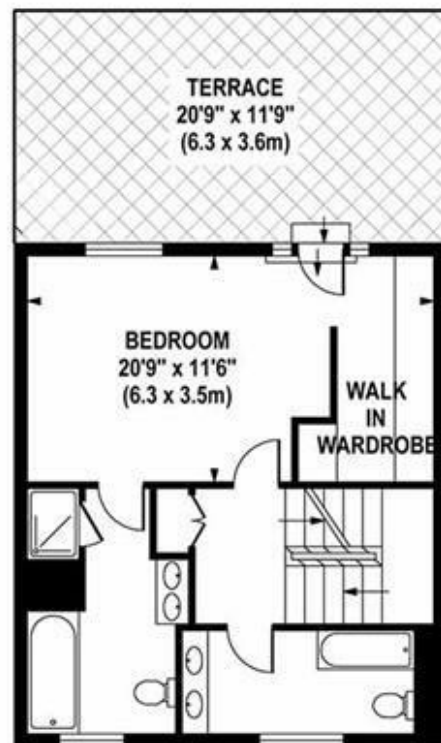
FIRST FLOOR GROSS INTERNAL FLOOR AREA 502 SQ FT

Although every attempt has been made to ensure accuracy, all measurements are approximate. The floor plan's for illustrative purposes only and not to scale. Measured in accordance to RICS standards.