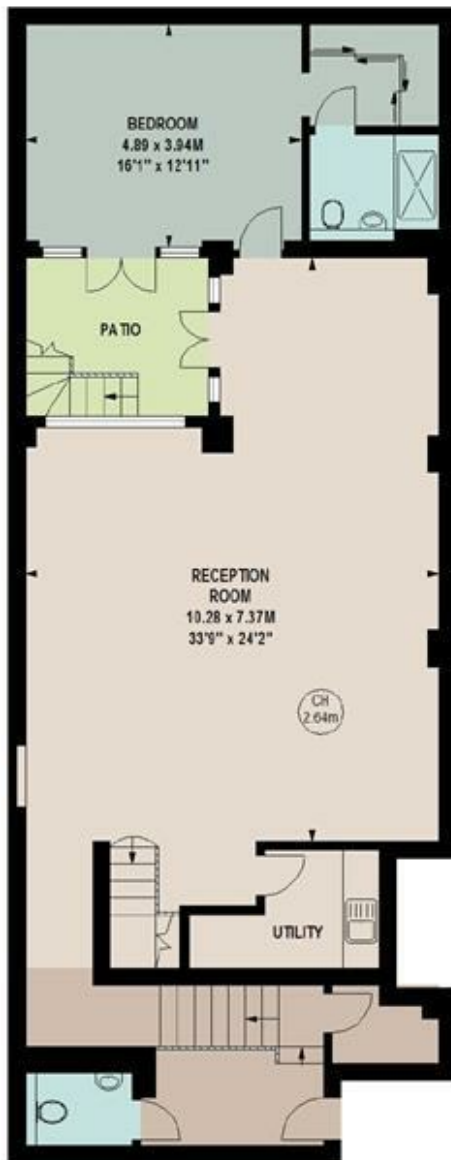
1389 sq ft Lower Ground Floor