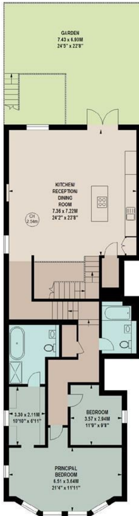
1565 sq ft Ground Floor

The floor plan is not to scale and measurements and areas shown are approximate and therefore should be used for illustrative purposes only. The plan has been prepared in accordance with the RICS code of Measuring Practice and whilst we have confidence in the information produced, it must not be relied on. If there is any aspect of particular importance, you should carry out or commission your own inspection of the property. Copyright of Stu J Beesley.