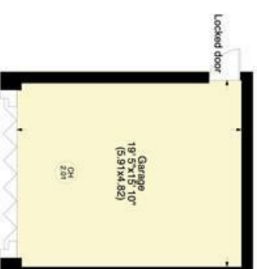
Lower Ground / Road level