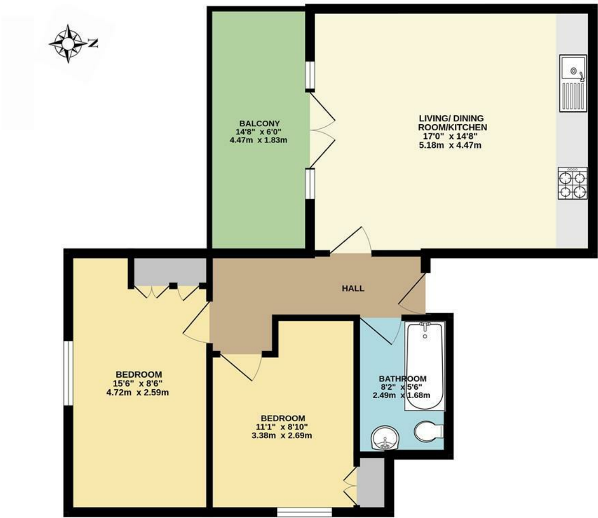
FIRST FLOOR FLAT

OAK HILL ROAD, SURBITON INTERNAL FLOOR AREA (APPROX.) 592 sq ft/ 55.0 sq m