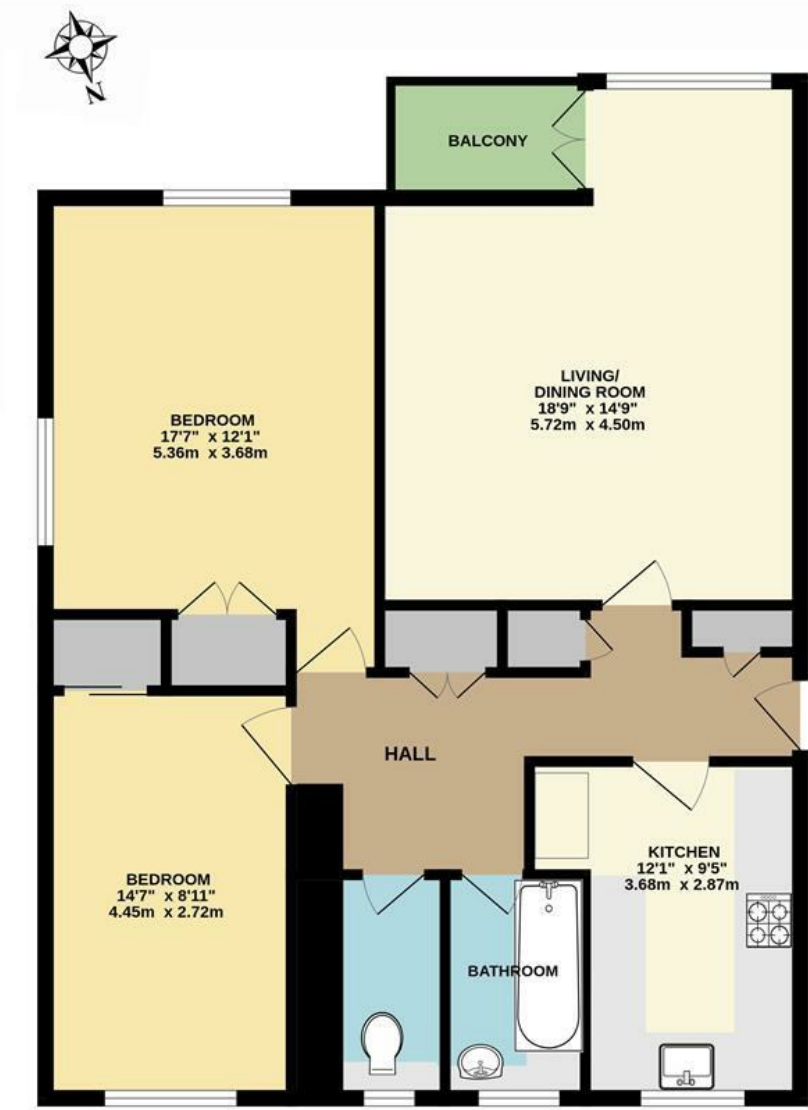
FIRST FLOOR FLAT