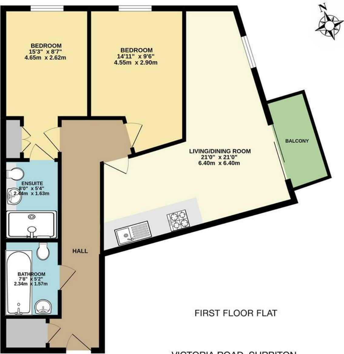
FIRST FLOOR FLAT

VICTORIA ROAD, SURBITON INTERNAL FLOOR AREA (APPROX.) 715 sq ft/ 66.2 sq m