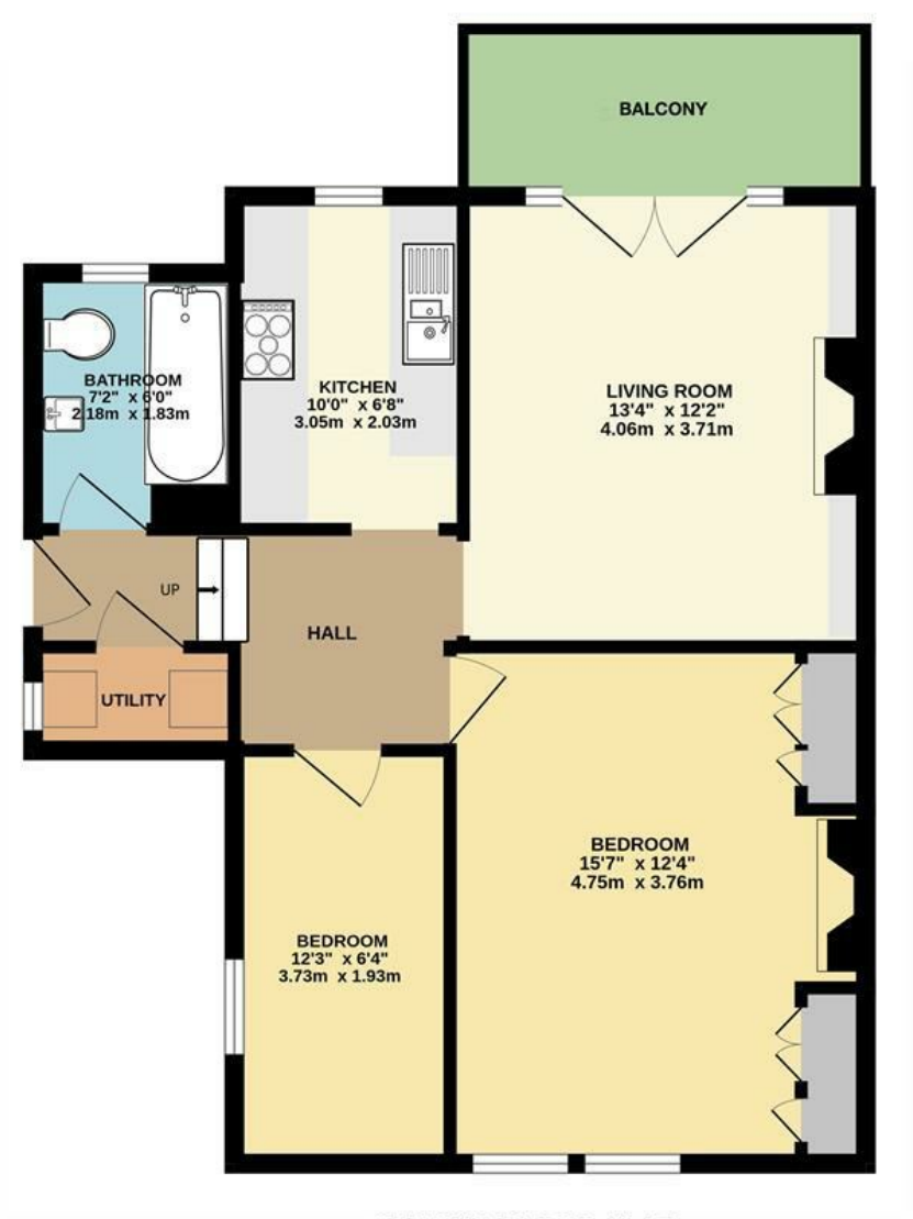
SECOND FLOOR FLAT