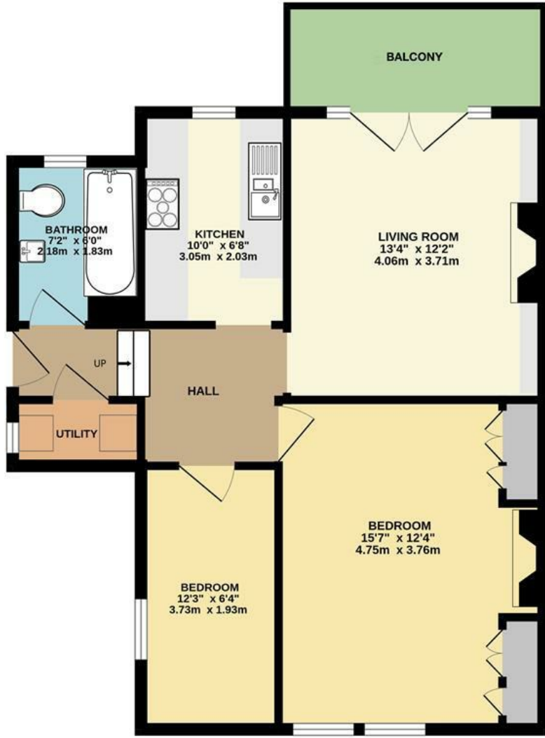
SECOND FLOOR FLAT