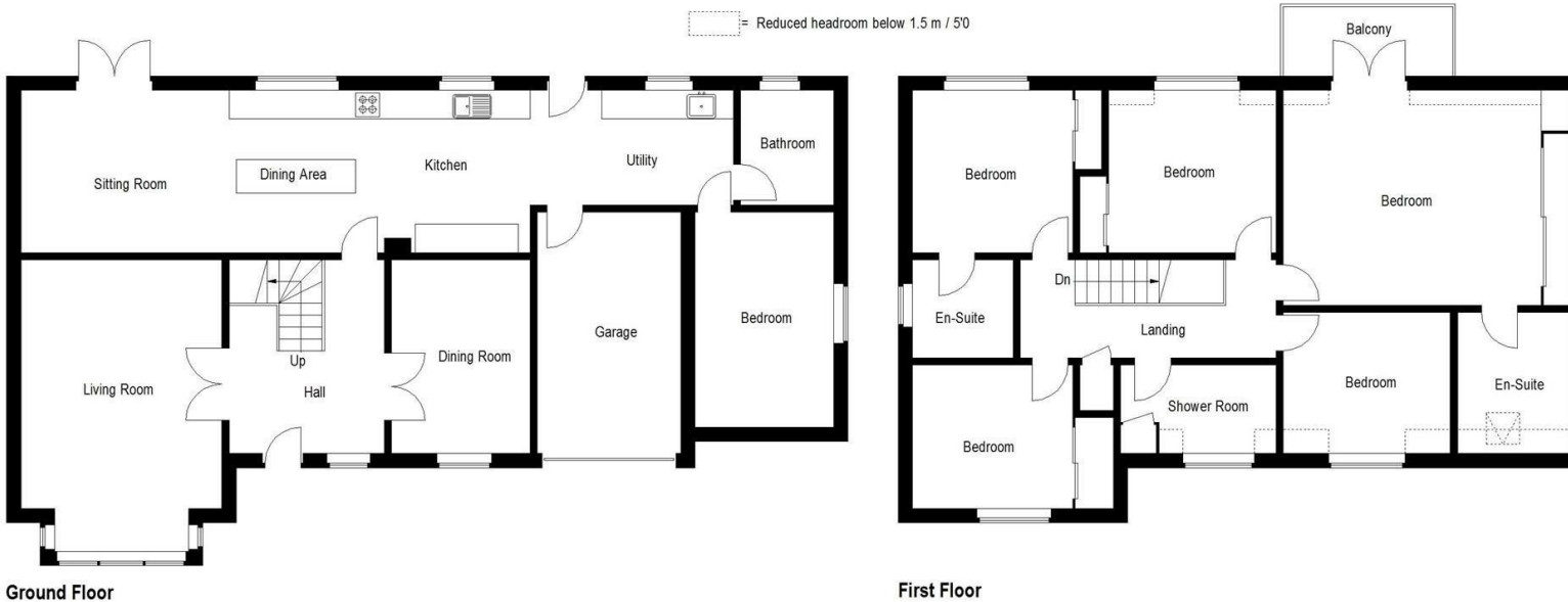
Illustration for identification purposes only, measurements are approximate, not to scale. floorplansUsketch.com © (ID1087473)

first for homes first for property in life - firstforhomes.co.uk