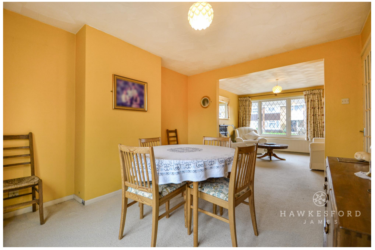
Nestled within a sought-after area to the south of town, this property presents an exceptional opportunity for versatile family living. Boasting three/four bedrooms and offered with the added advantage of no forward chain, it epitomises convenience and comfort.

Upon crossing the threshold, you're welcomed by a spacious entrance porch leading to an inviting entrance hall. The heart of family activity, a dual-aspect double reception room provides ample space for gatherings and relaxation. The kitchen/breakfast area, part of a well-conceived ground floor extension, seamlessly connects to an inner lobby, downstairs cloakroom, and a flexible family room, ideal for older children or as a fourth bedroom.