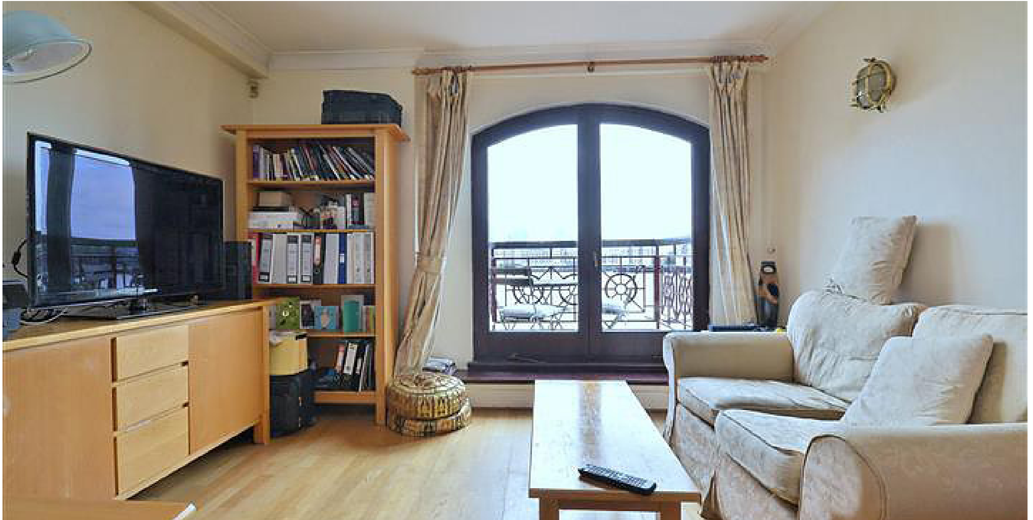
TRAFALGAR COURT, Wapping E1W