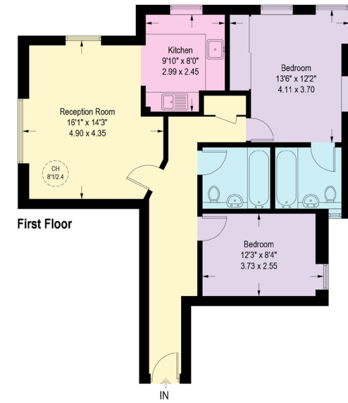
Illustration for identification purposes only, measurements are approximate, not to scale. (ID1186171)