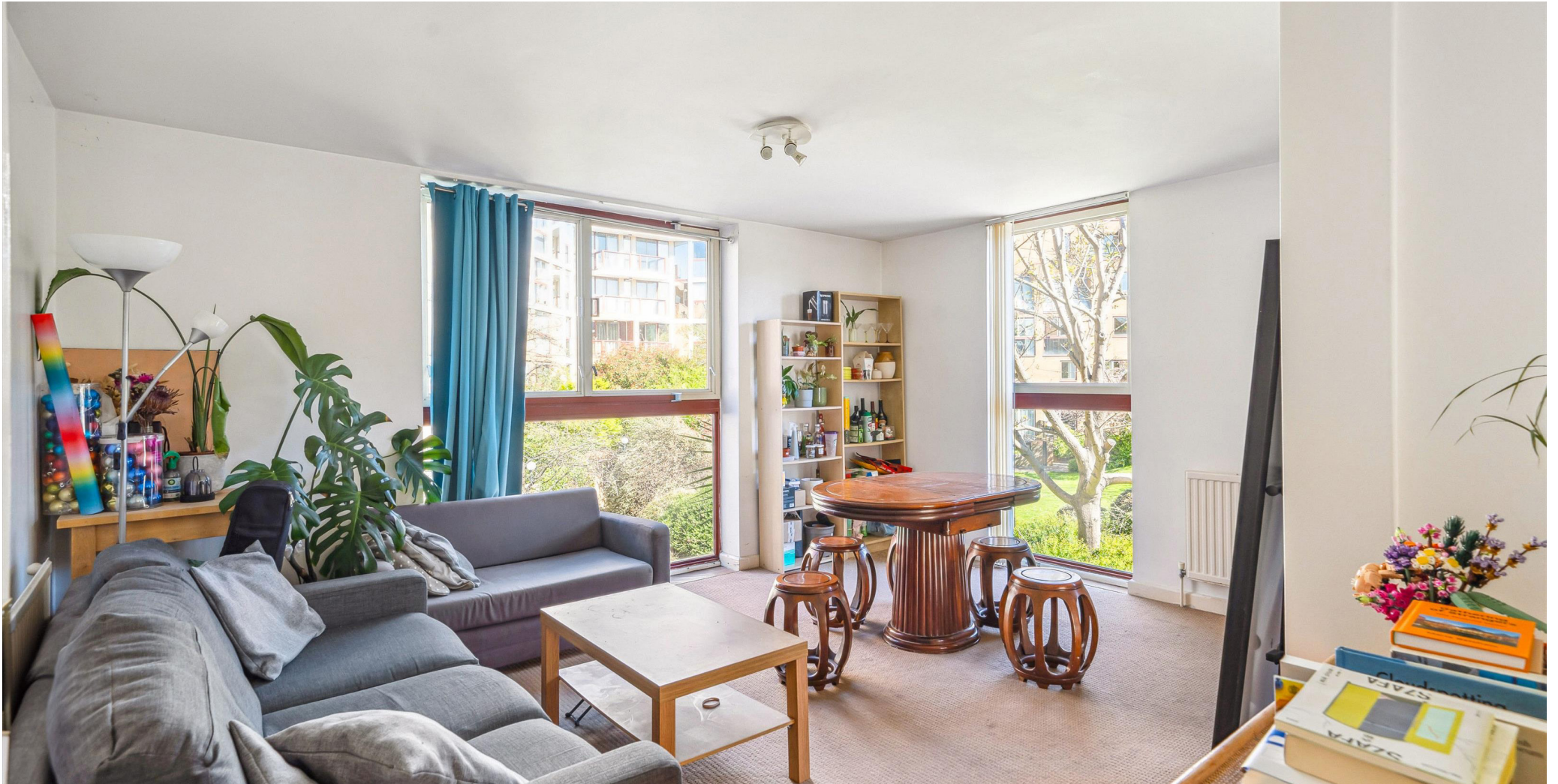
CAPE YARD, QUAY 430, Wapping E1W