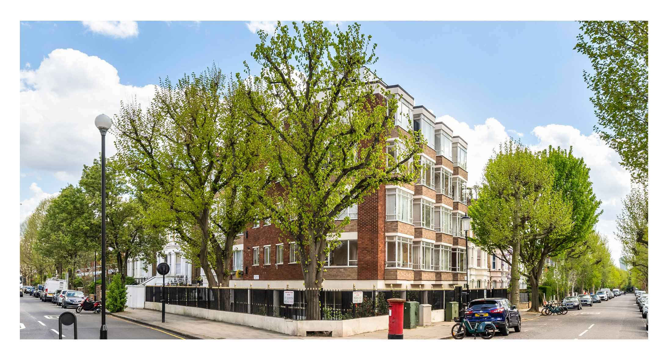
ST. QUINTIN AVENUE,