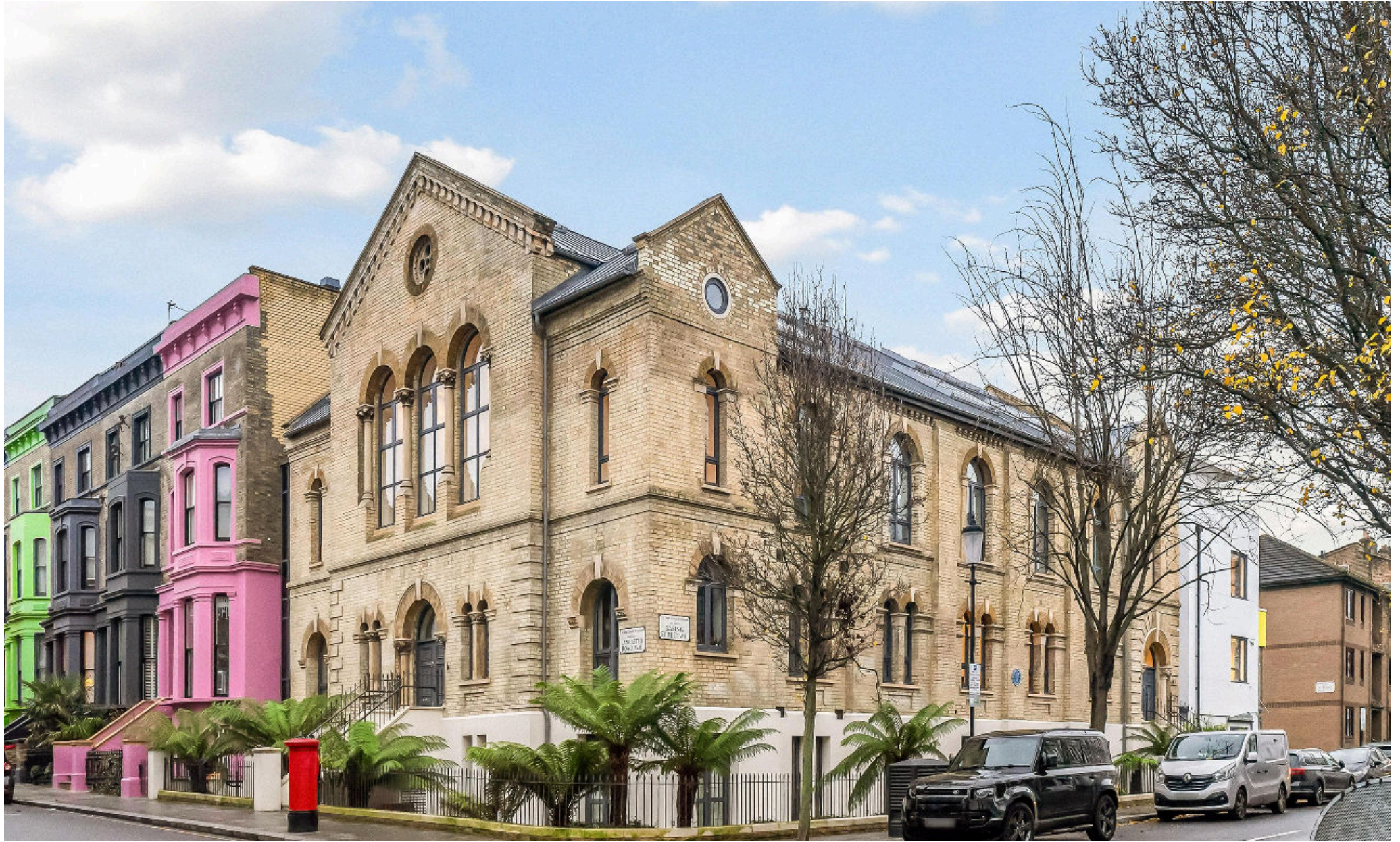
Basing Street, Notting Hill W11