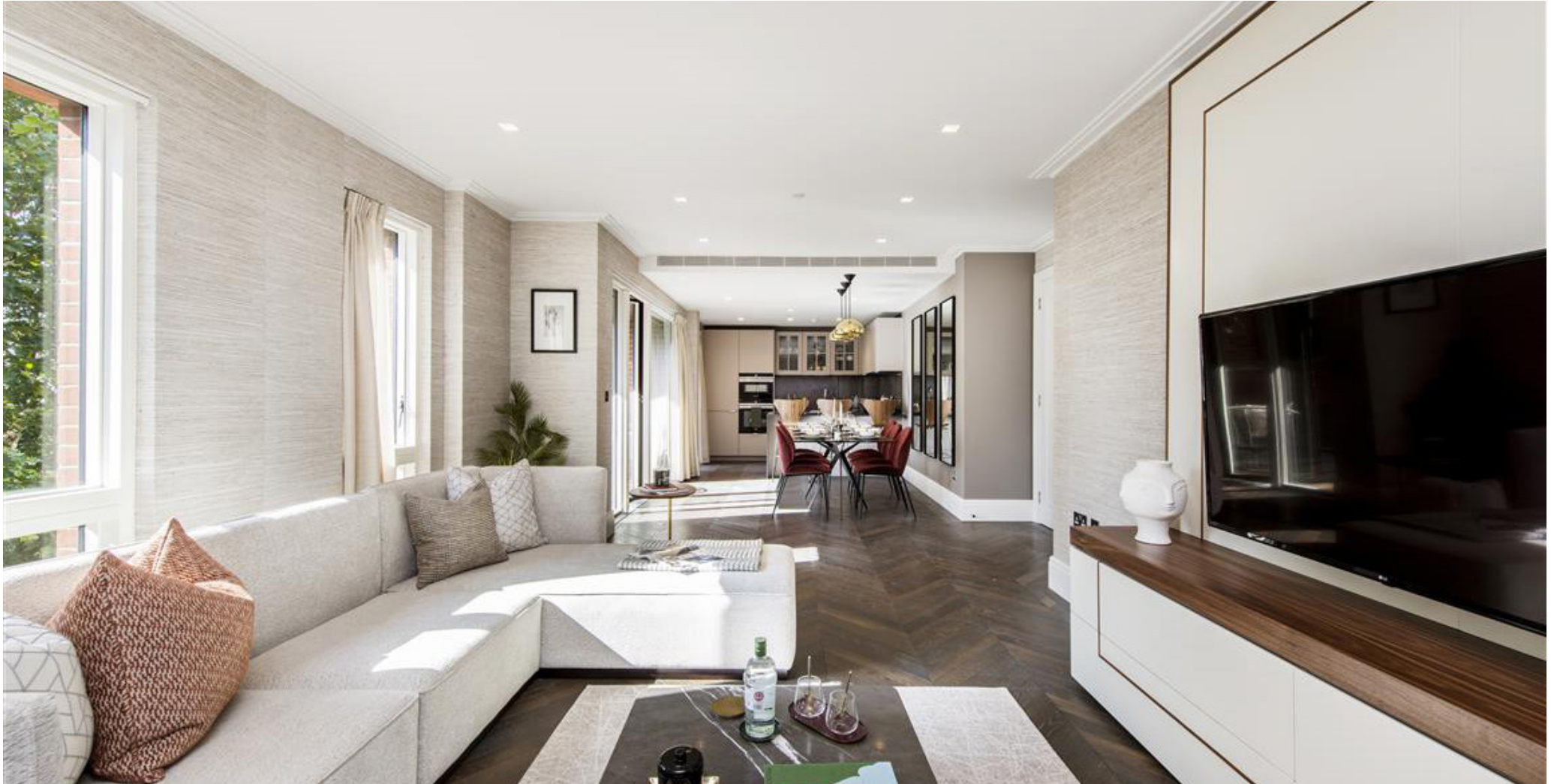
KIDDERPORE AVENUE, Hampstead NW3