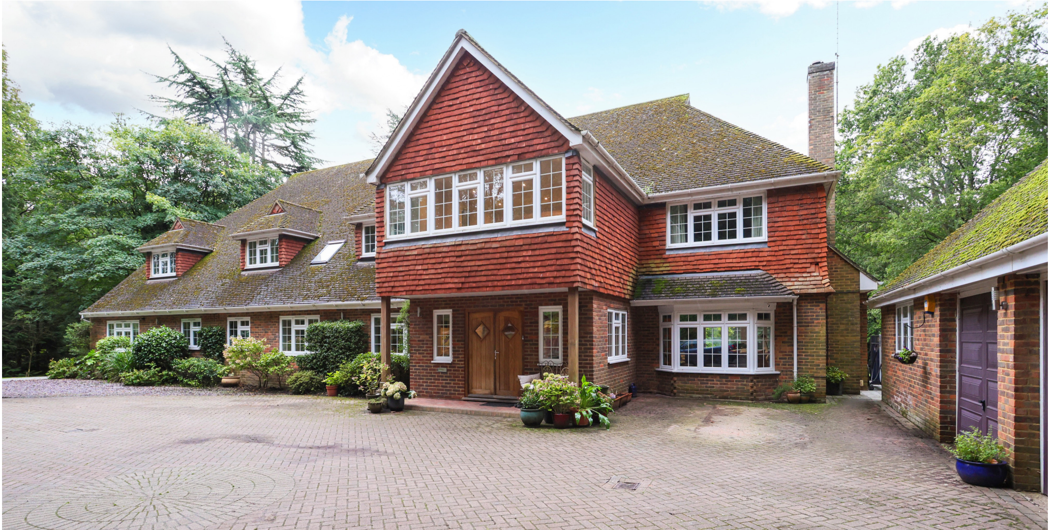
ST. JOHNS, Woking GU21