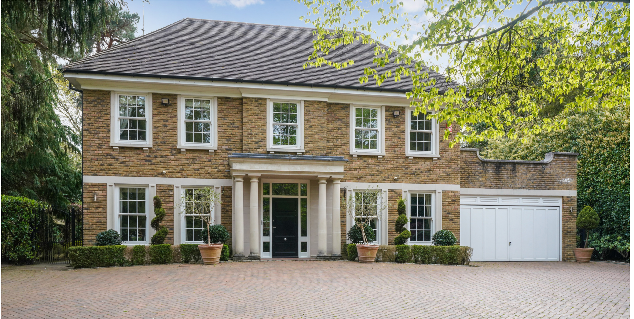
GRANVILLE CLOSE, Weybridge KT13