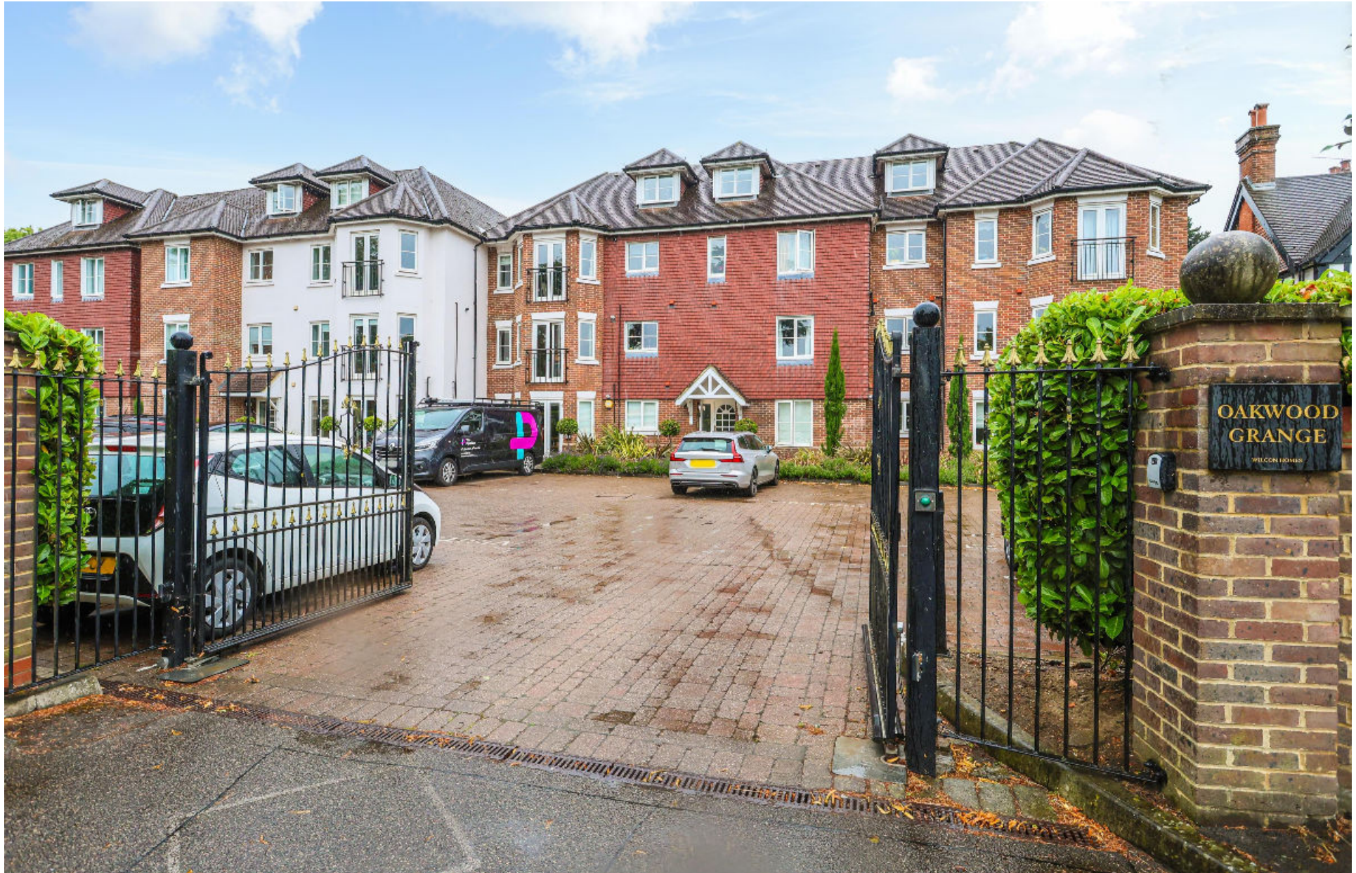
Oatlands Chase, Weybridge, Surrey KT13