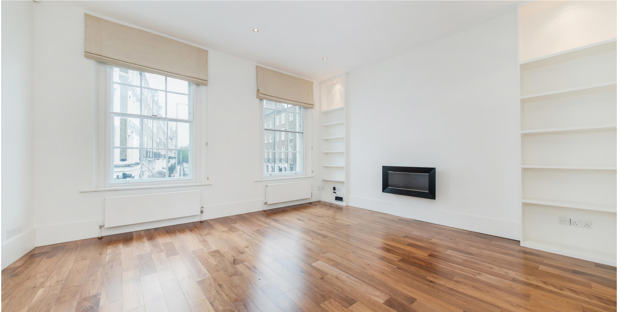
SYDNEY MEWS, Chelsea SW3