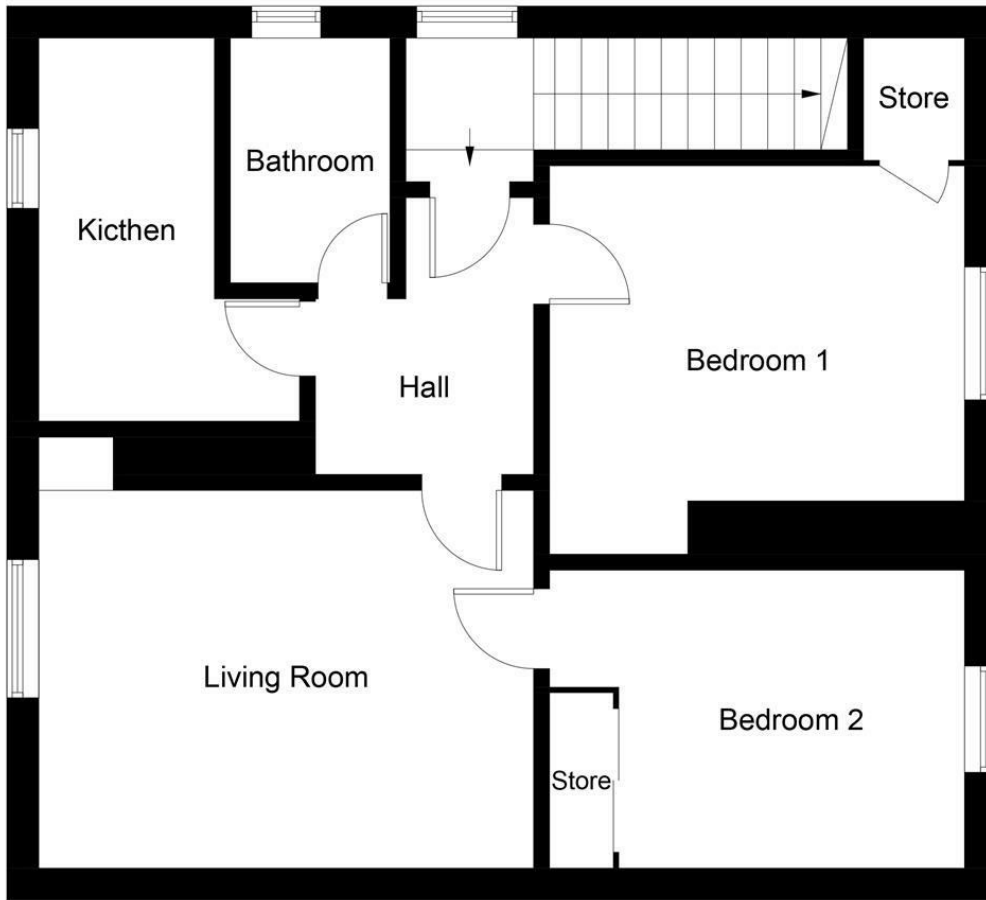
Illustration for identification purposes only, measurements are approximate, not to scale. floorplansUsketch.com © (ID1100080)