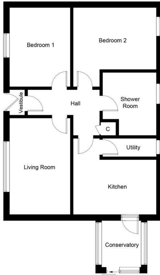
Illustration for identification purposes only, measurements are approximate, not to scale. (ID1059659)