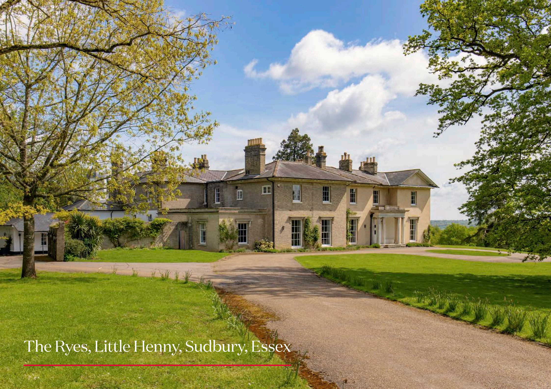
The Ryes, Little Henny, Sudbury, Essex