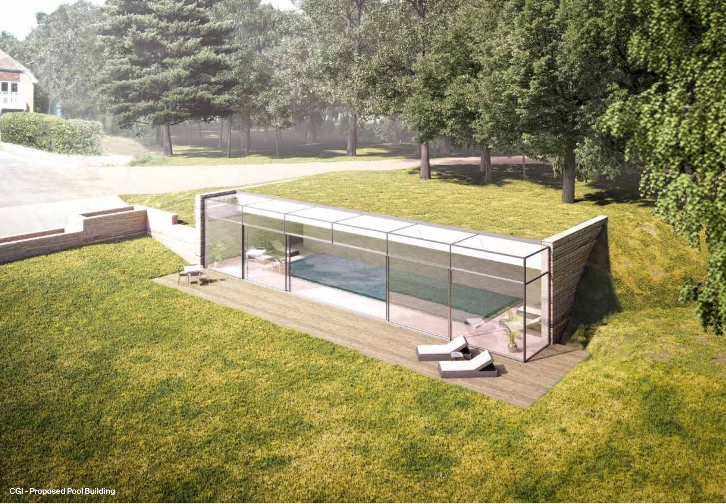
CGI - Proposed Pool Building