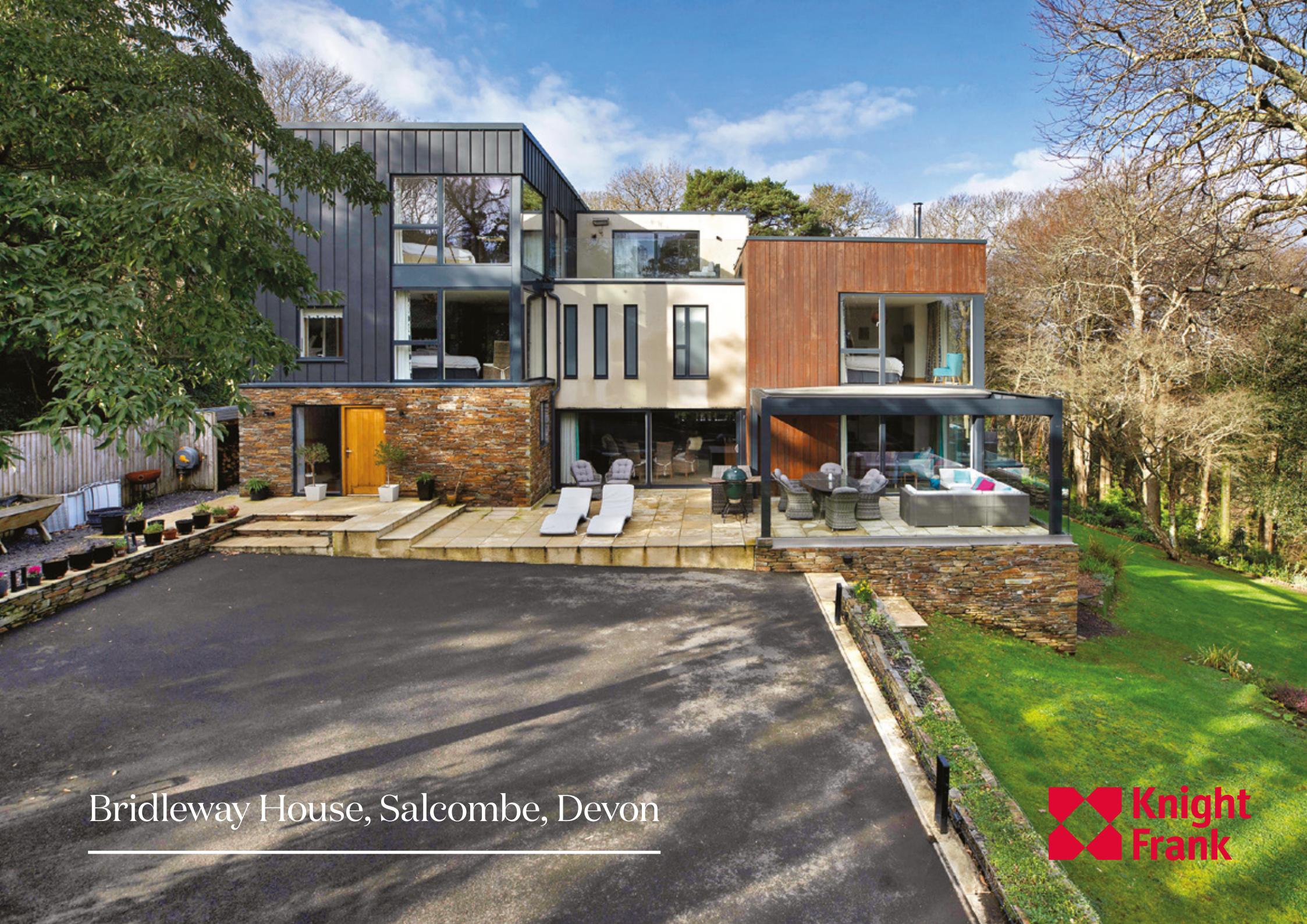
Bridleway House, Salcombe, Devon