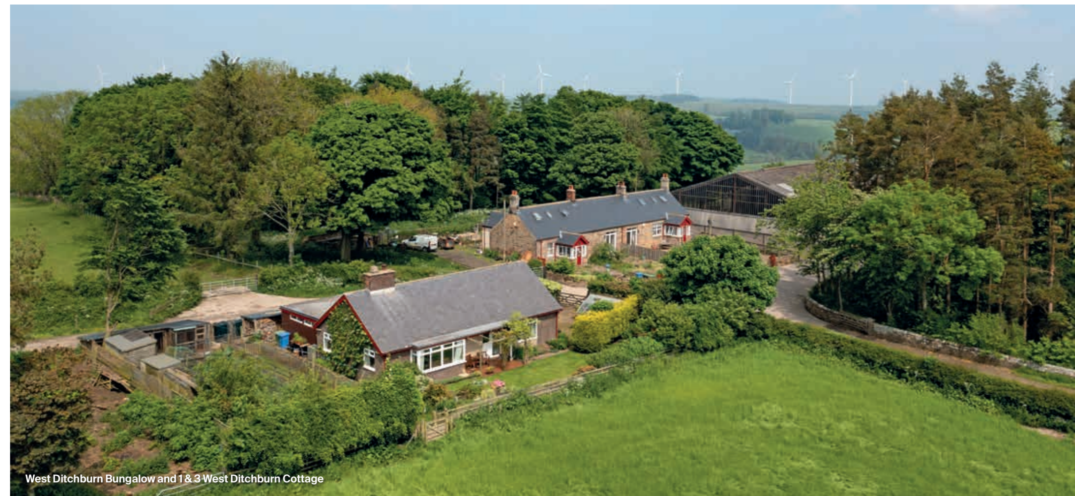
West Ditchburn Bungalow and 1 & 3 West Ditchburn Cottage