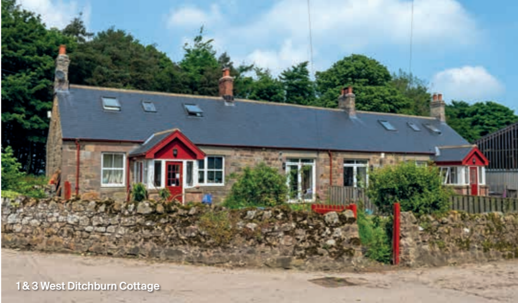
1 & 3 West Ditchburn Cottage

Further to the west is West Ditchburn Bungalow which sits in a wonderful position with incredible views. It has a sitting room, kitchen with pantry, WC and utility along with 3 bedrooms, shower room and a large storeroom. It has a parking area and garden to the south. The bungalow is tenanted by a former farm worker.