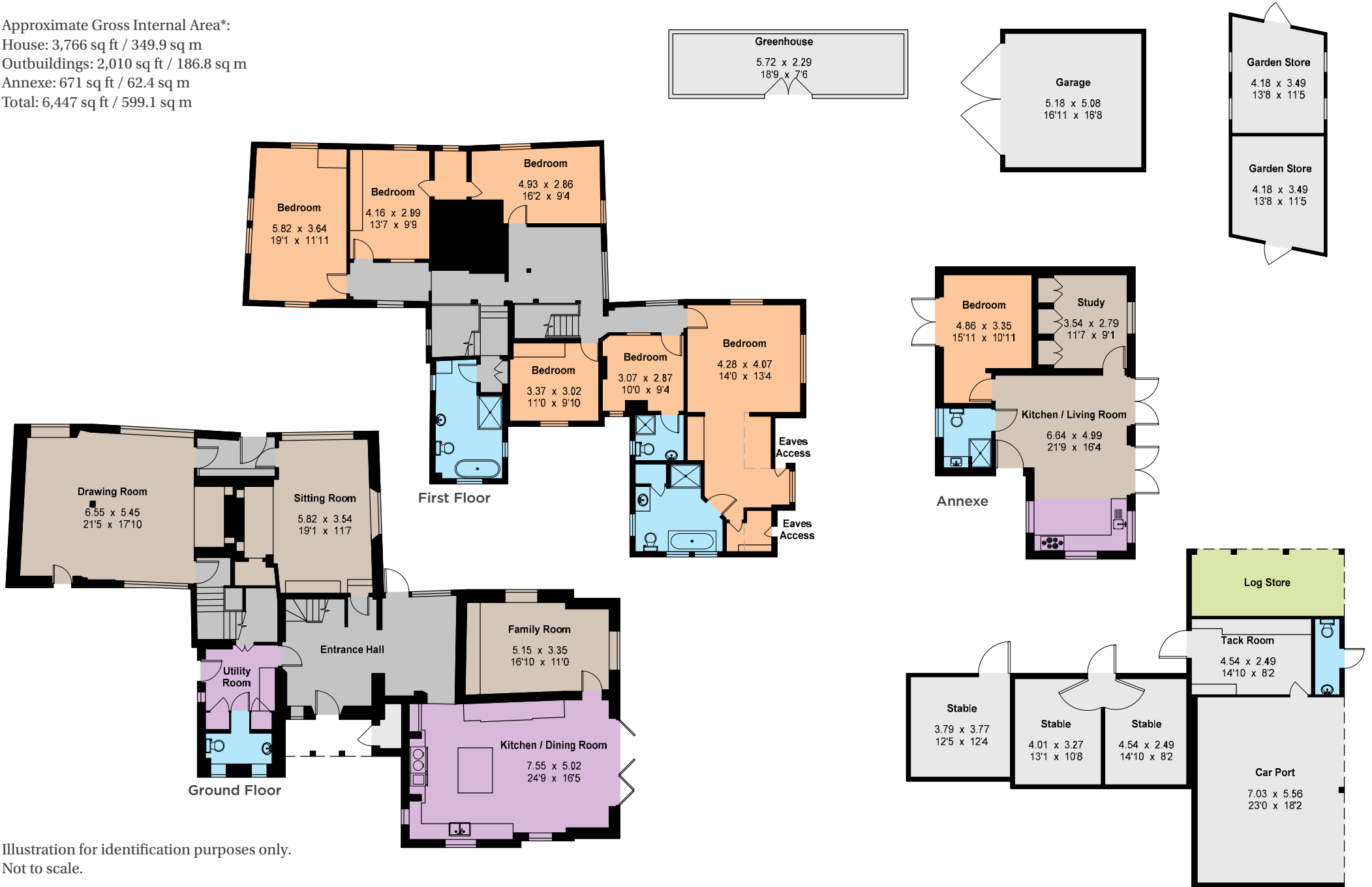
Illustration for identification purposes only. Not to scale.