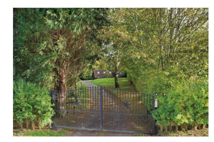
Lot 2: Cottage Approximate Floor Area 969 sq ft (90.0 sq m)