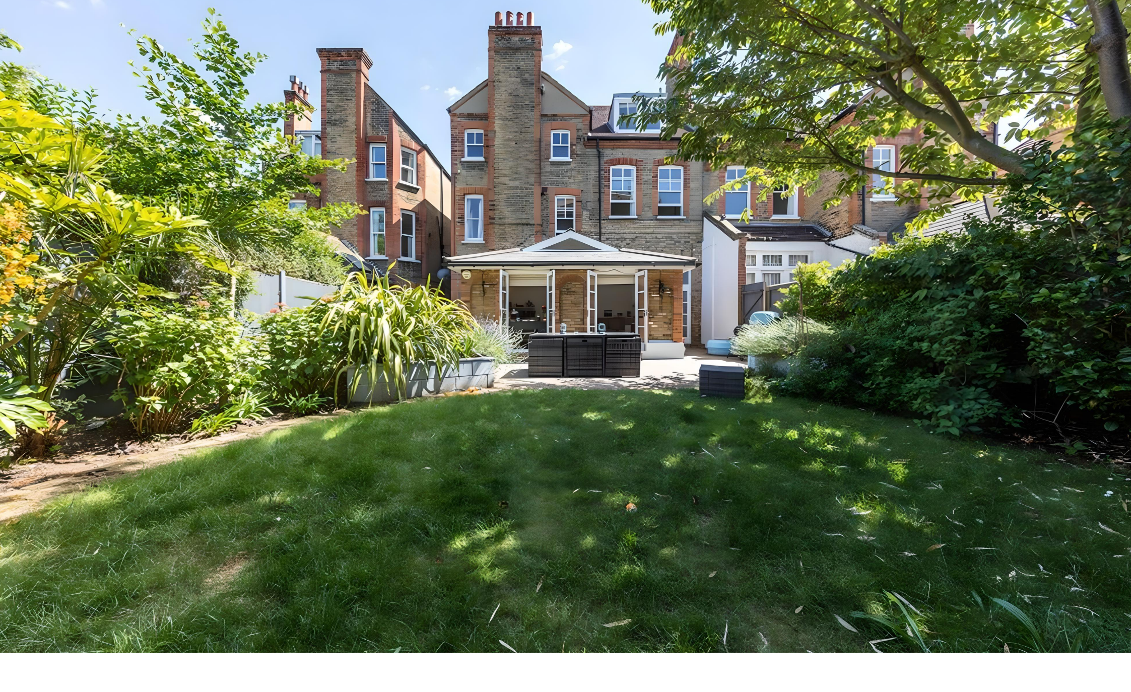
Nightingale Lane, London SW12