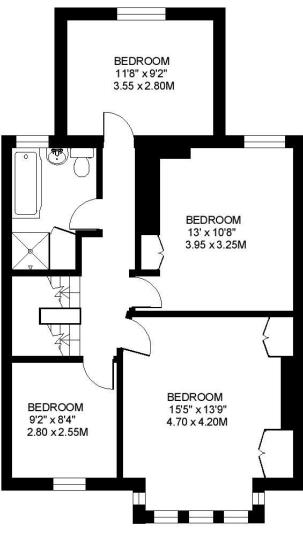
FIRST FLOOR 730 SQ.FT.

This plan is for guidance only and must not be relied upon as a statement of fact. Attention is drawn to the important notice on the last page of the text of the Particulars.