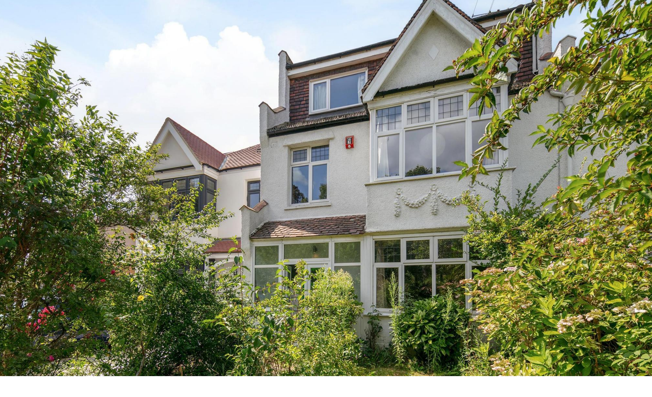
Sandgate Lane, London SW18