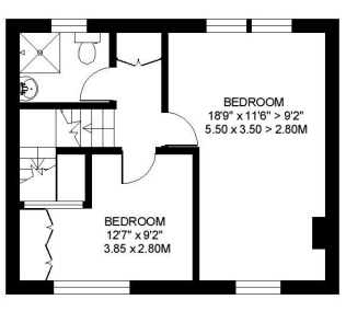
SECOND FLOOR 402 SQ.FT.