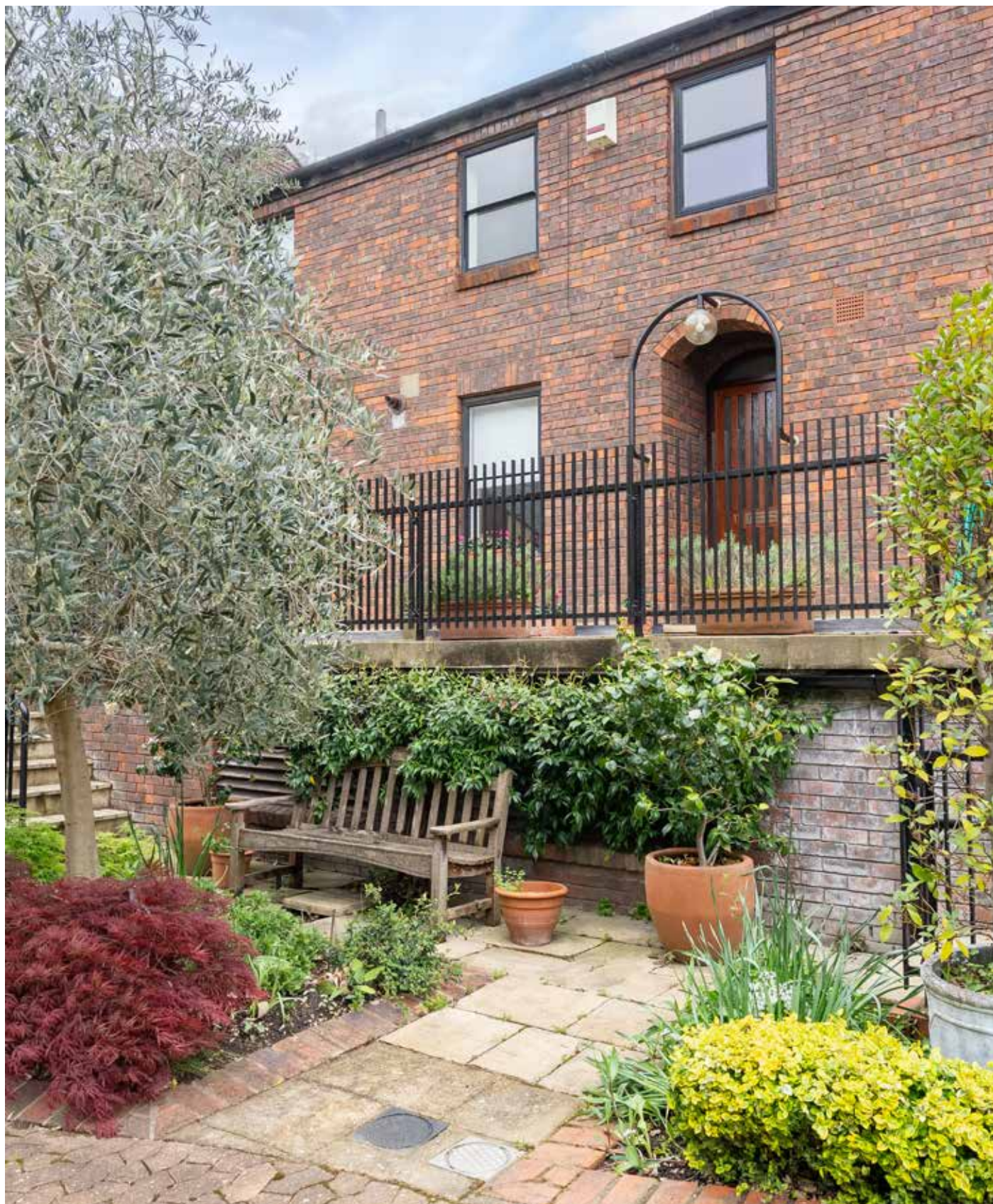
HAYGARTH PLACE Wimbledon, SW19