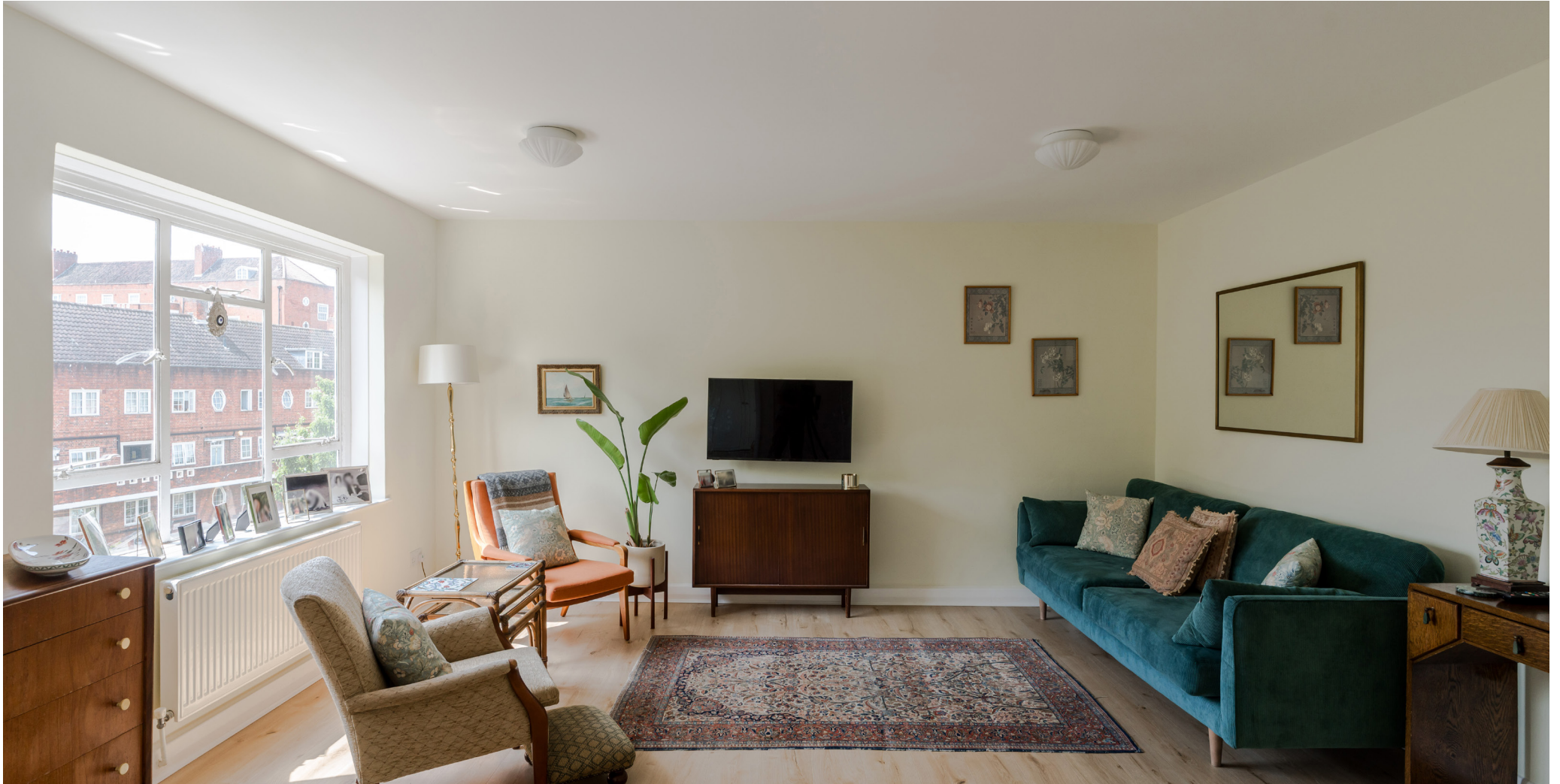
CHARLBERT COURT, CHARLBERT STREET, St John's Wood NW8