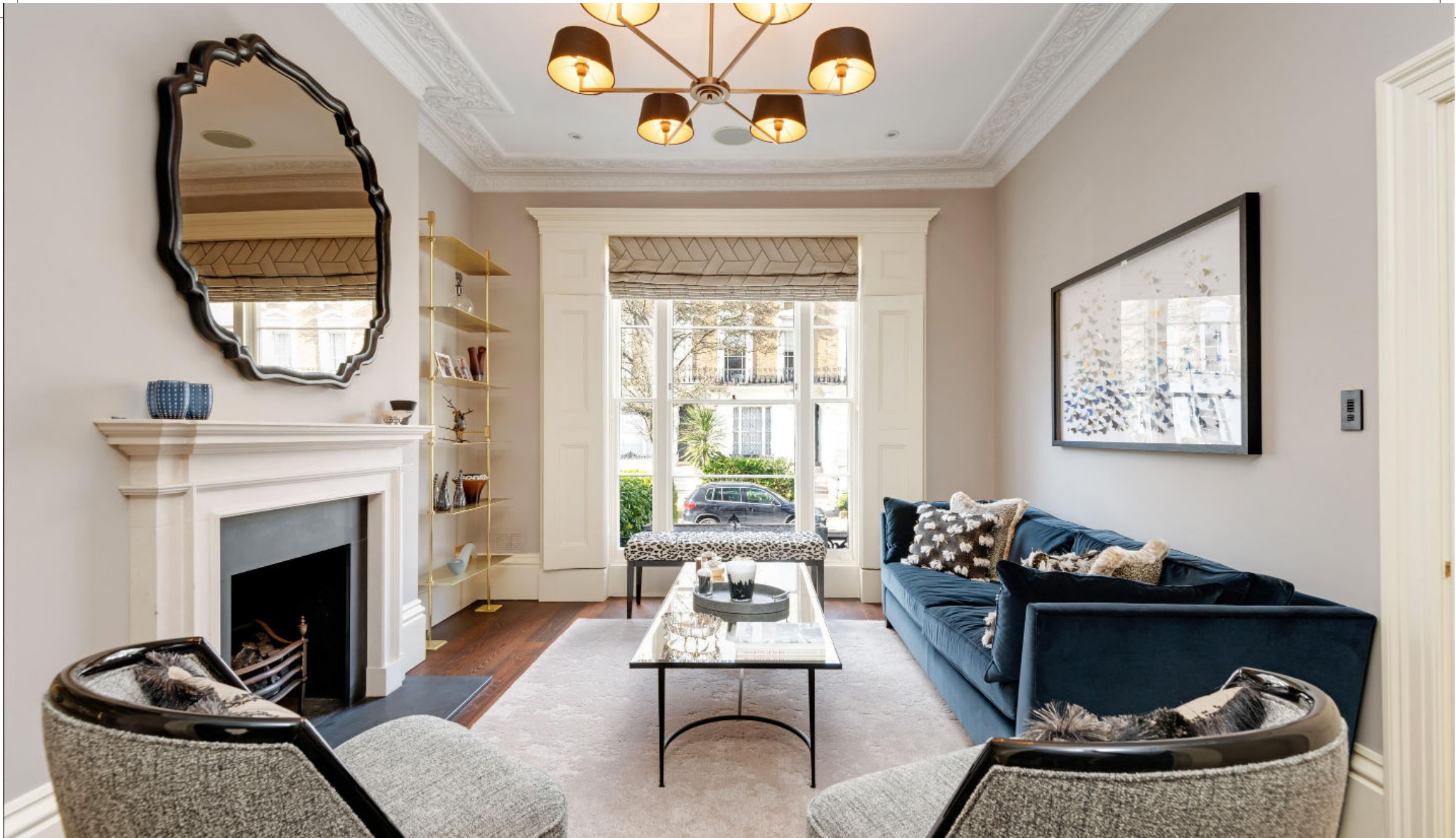
Abbey Gardens, St John's Wood NW8