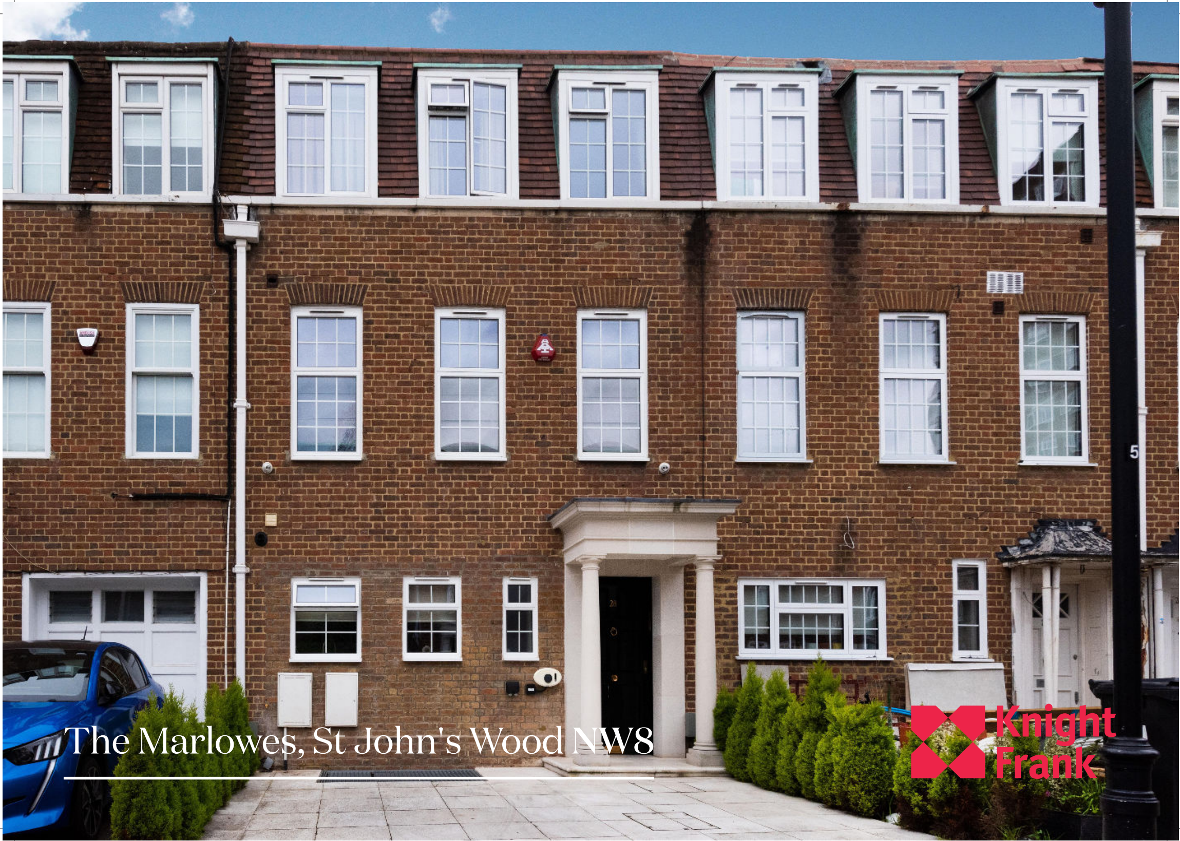
The Marlowes, St John's Wood NW8