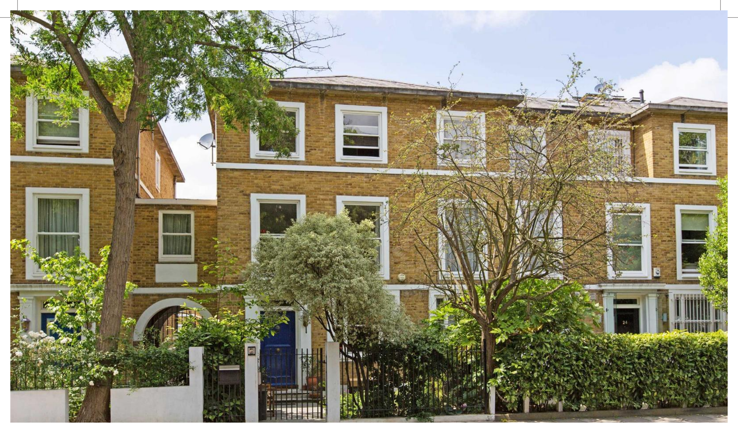
Marlborough Hill, St John's Wood NW8