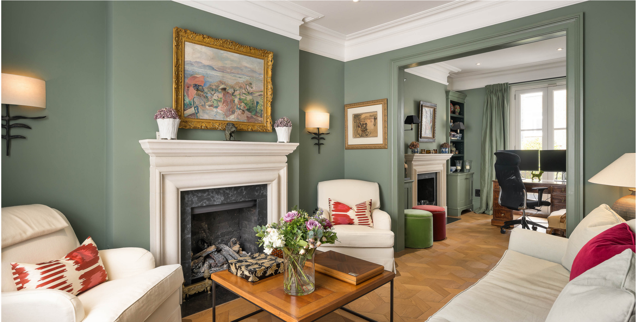
HALSEY STREET, Chelsea SW3