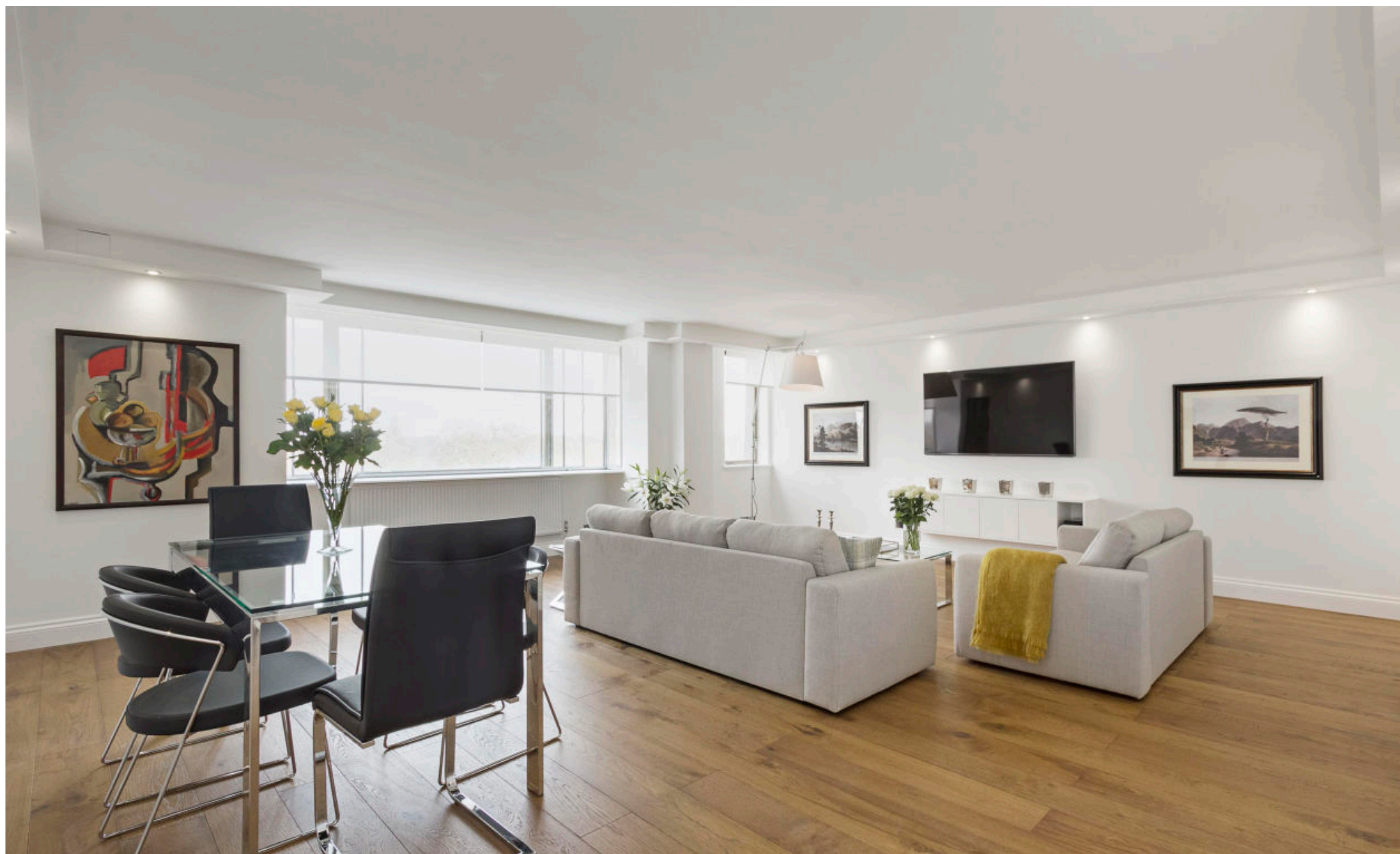
South Lodge, Knightsbridge, London SW7