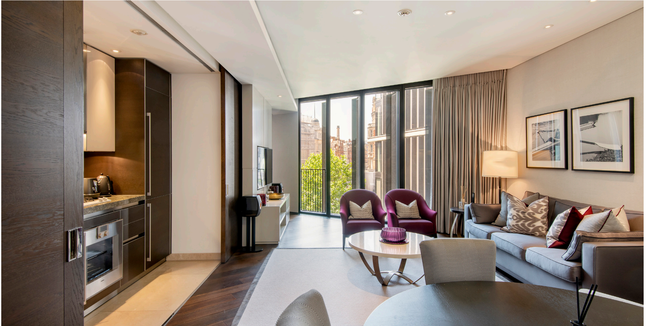
ONE HYDE PARK Knightsbridge SW1X