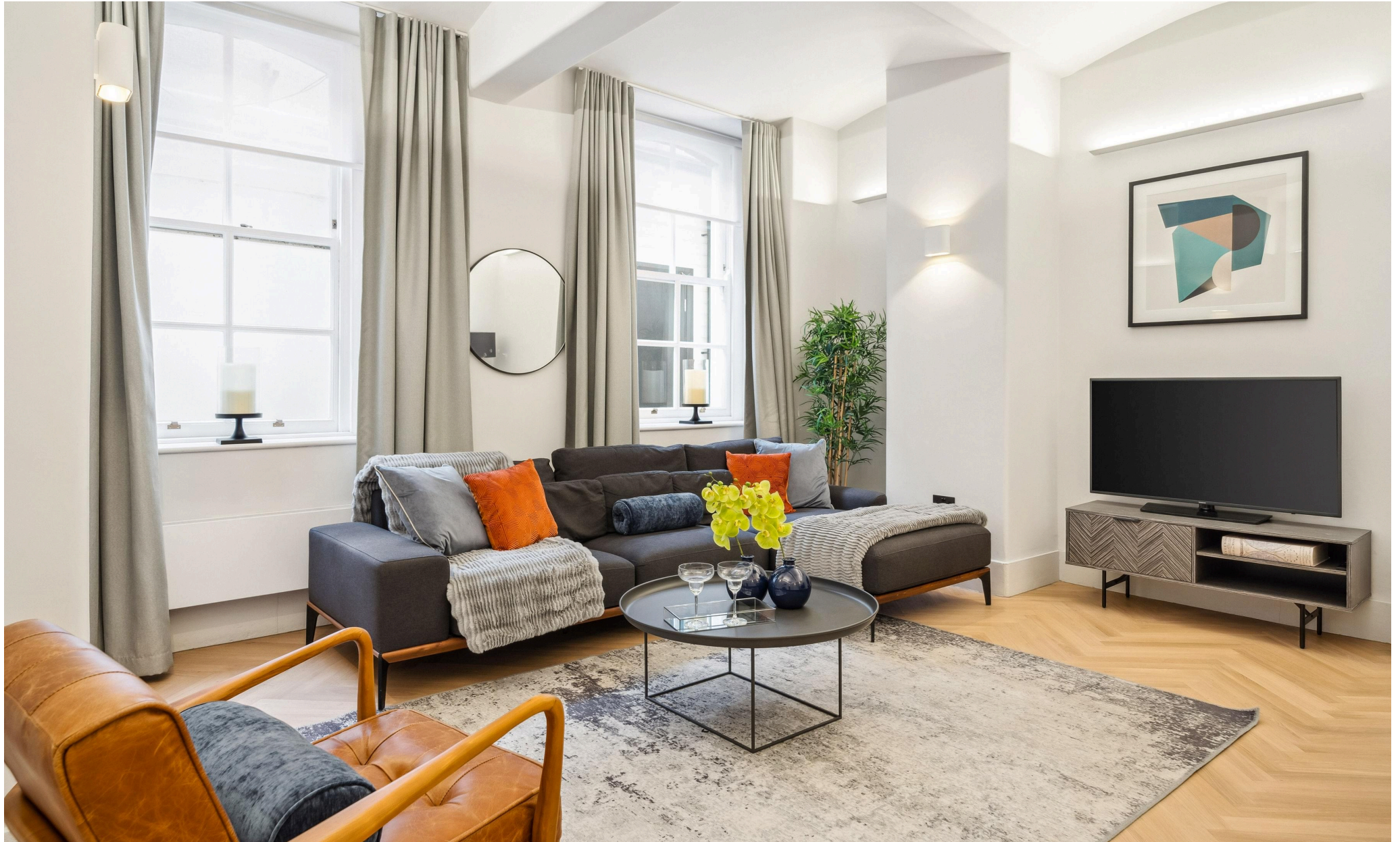
Albert Hall Mansions, Kensington Gore, London SW7