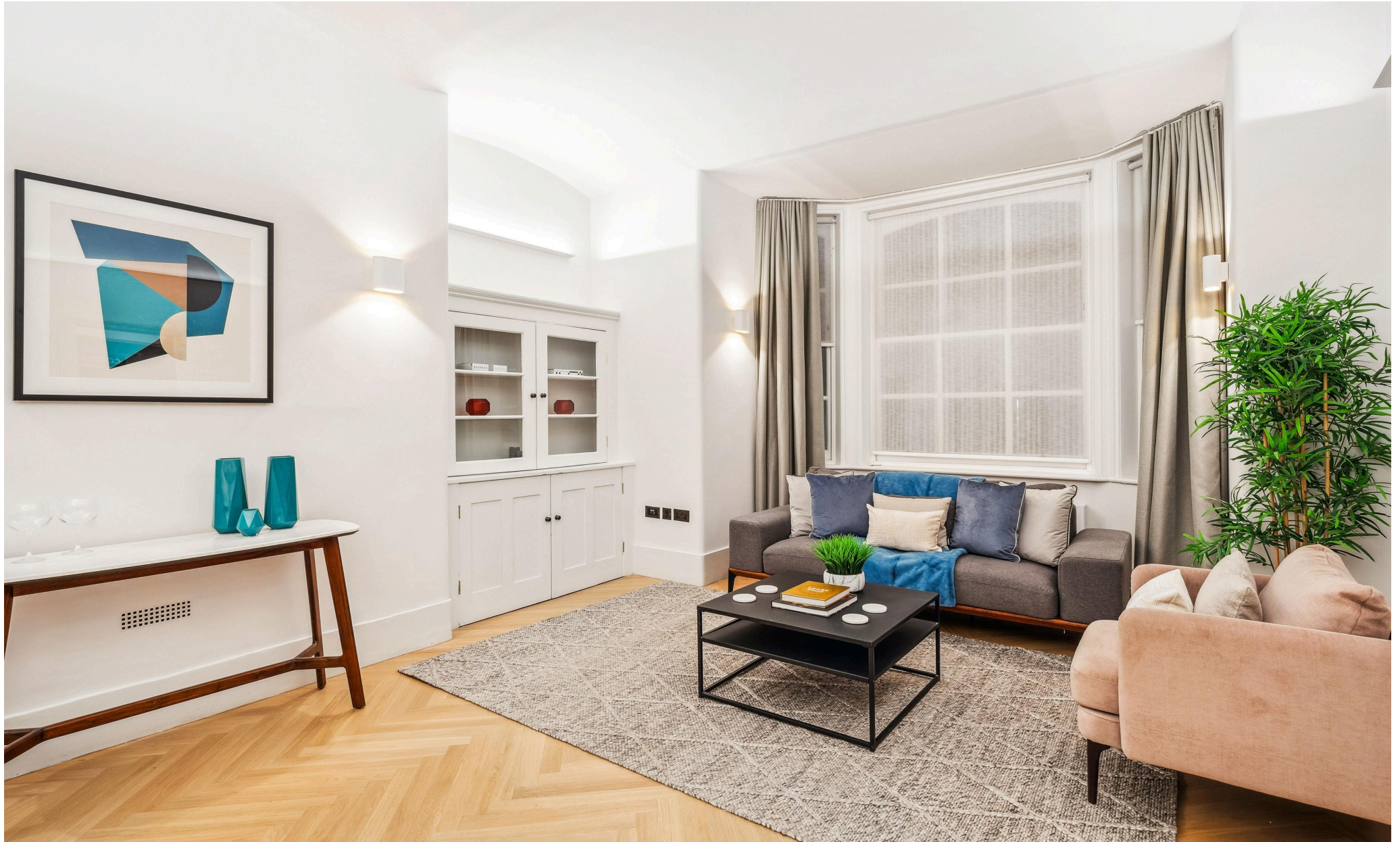
Albert Hall Mansions, Kensington Gore, London SW7