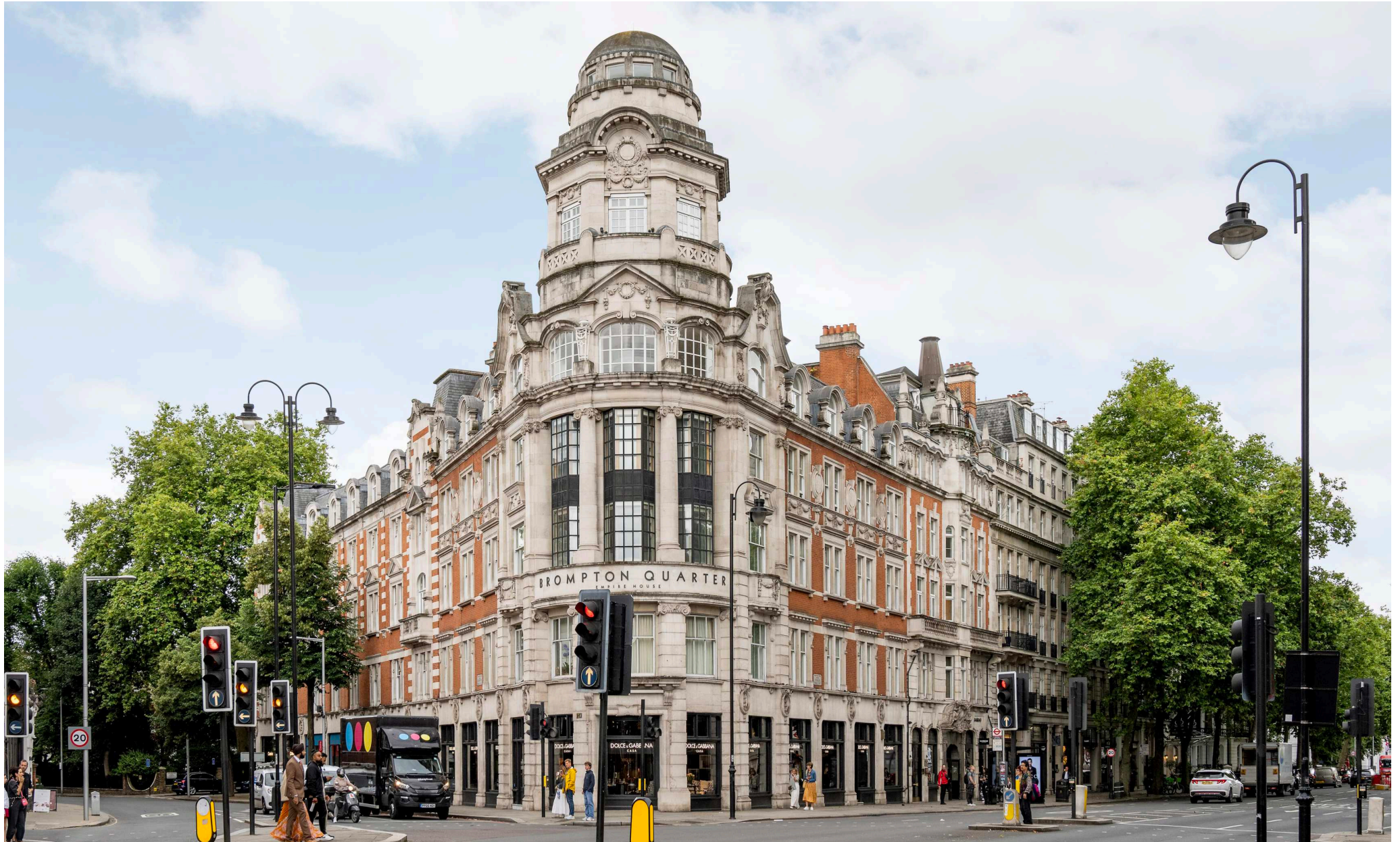
Empire House, Thurloe Place, London SW7