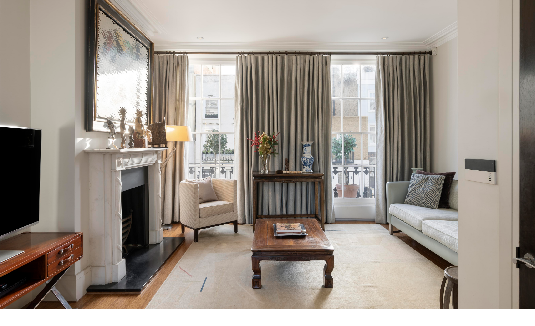
Milner Street, Chelsea, London SW3