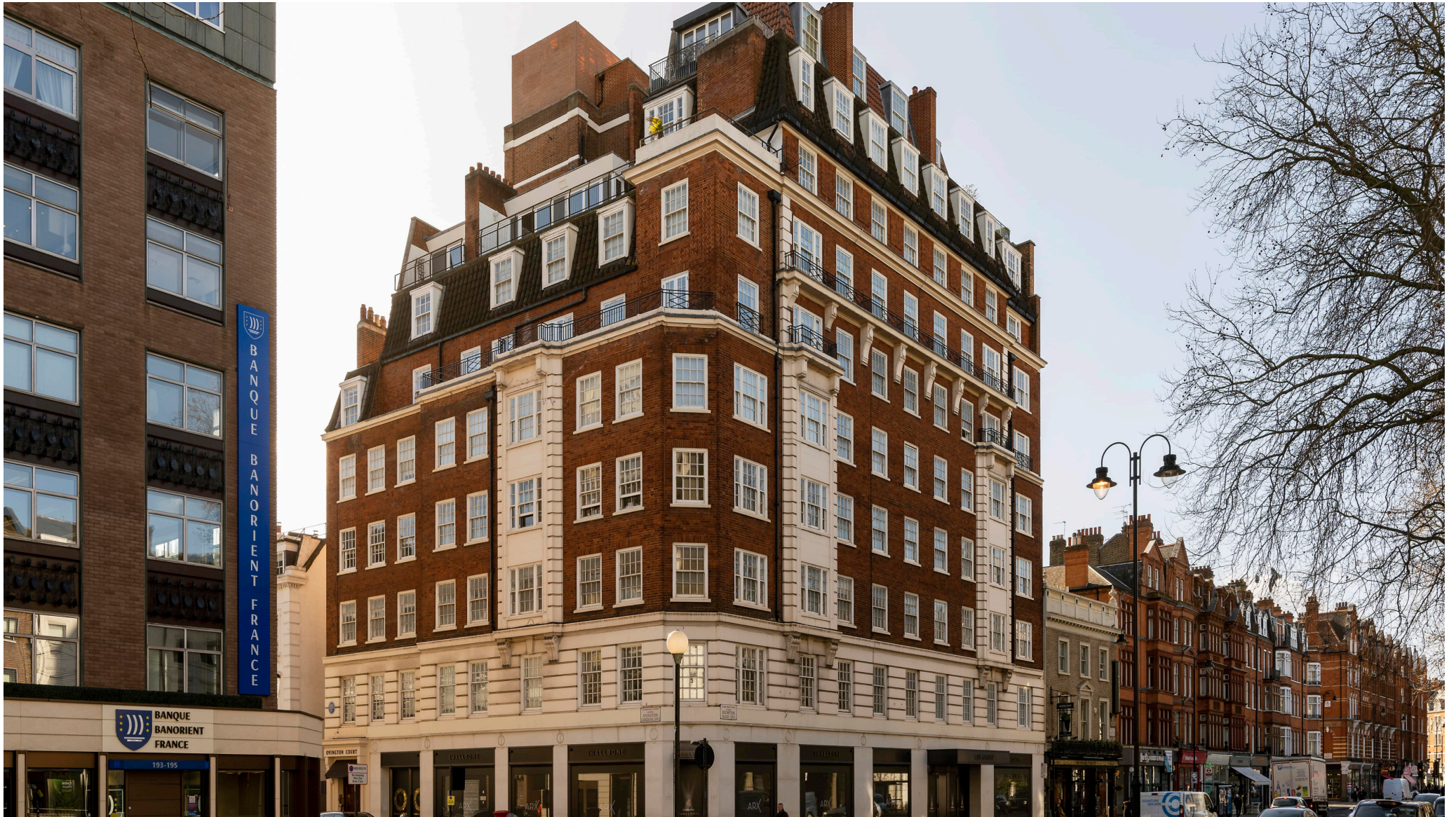
Ovington Court, Brompton Road Knightsbridge SW3