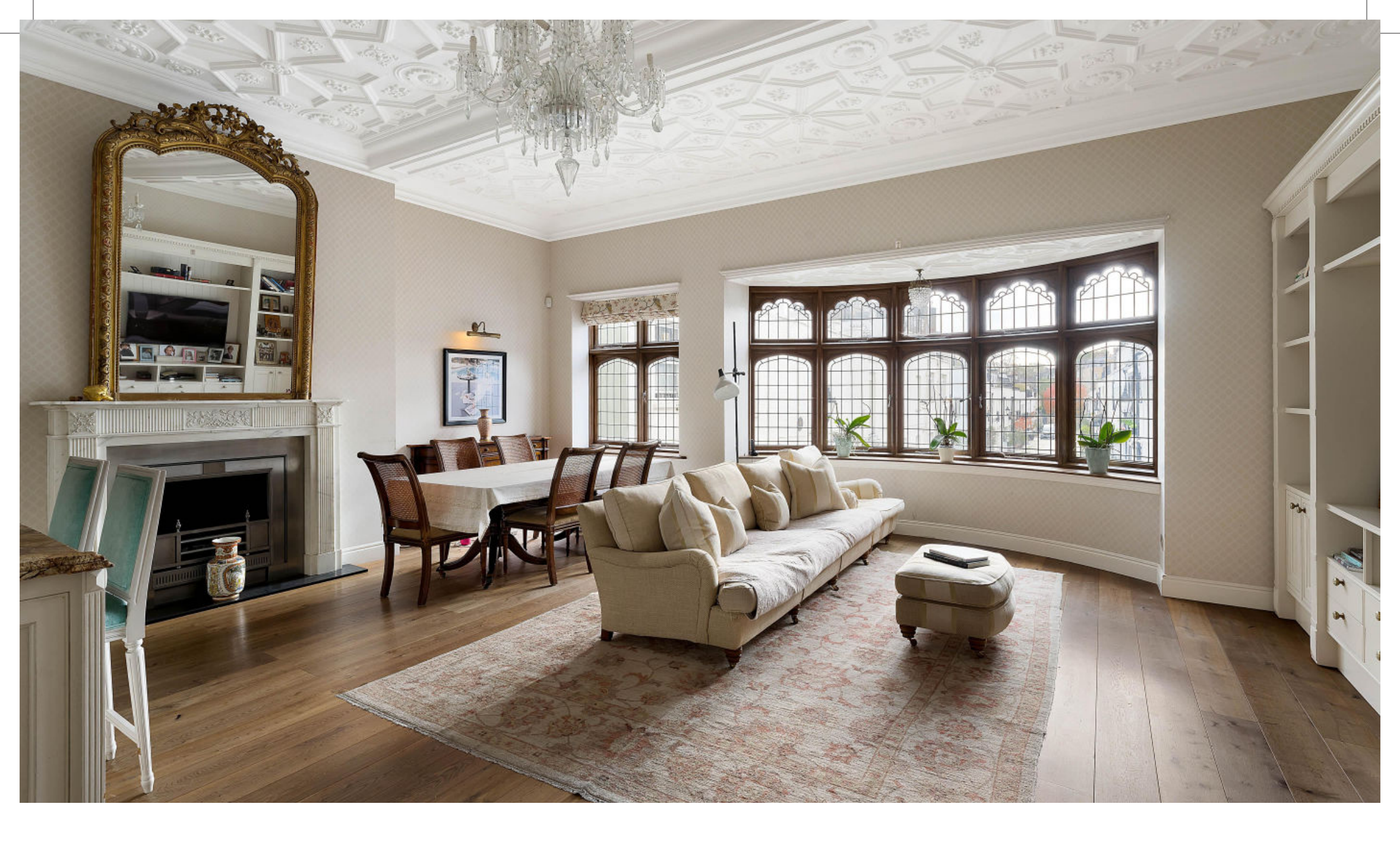
Ennismore Gardens, Knightsbridge SW7